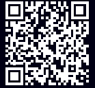
RUTM20 360° VIEW

Deploy 5G where size and cost matter. The RUTM20 is an ultra-compact global 5G router engineered for IoT and IIoT solutions. Leverage worldwide connectivity with a global Telit 5G modem. Streamline deployments with PoE, enabling single-cable power delivery. With integrated eSIM, you can manage carrier switching at scale, eliminating costly site visits. RUTM20 is perfect for space-constrained solutions like POS, surveillance, and transport.