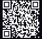
RUT901 360° VIEW

The RUT901 cellular router delivers the top-rated features of its predecessors, the RUT950 and RUT951, to the market. The router features dual SIM 4G cellular connectivity and Wi-Fi, as well as 4x Ethernet interfaces, to meet the needs of the many varied IoT solutions. The device ensures high-performance, providing automatic WAN failover to an available backup connection, guaranteeing network continuity, and eliminating downtime. The RUT901 is dedicated to professional industrial use cases with its high customization possibilities, security features, industrial protocols, and compatibility with Teltonika Networks' Remote Management System (RMS).